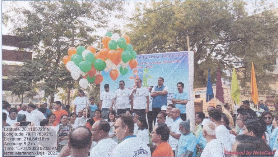
Marathon-Run for Friendship Dt. 15/1/2023